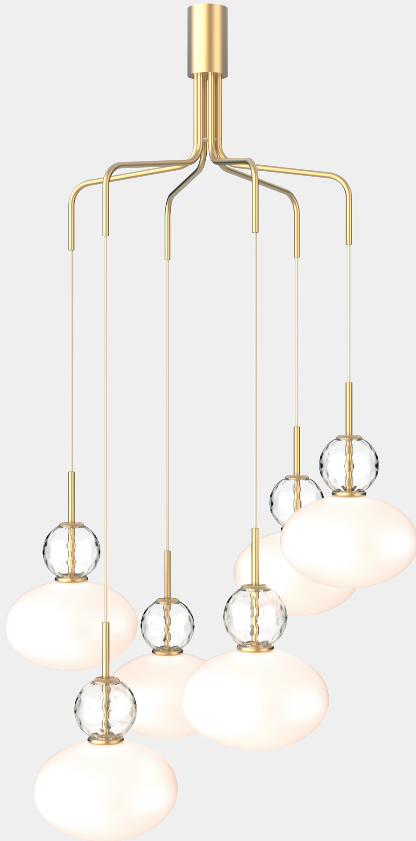
RIZZATTO CLUSTER 6 satin brass / opal